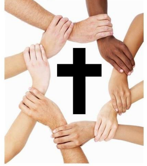
Shown in Fellowship