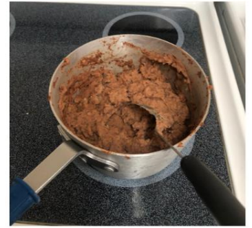
Photos of 2/28 Wednesday night Lenten Supper, Indian tacos being made.