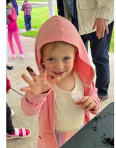
We celebrated our mothers by decorating pots and planting flowers in them.